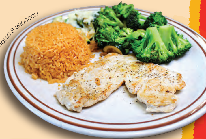
POLLO & BROCCOLI

Grilled chicken breast seasoned with herbs and spices. Served with grilled broccoli, zucchini and rice 16