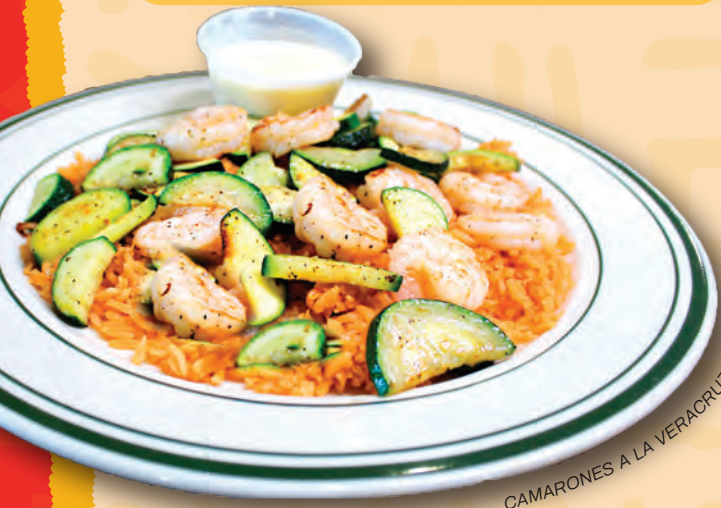
CAMARONES A LA VERACRUZ