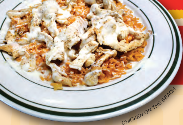
CHICKEN ON THE BEACH