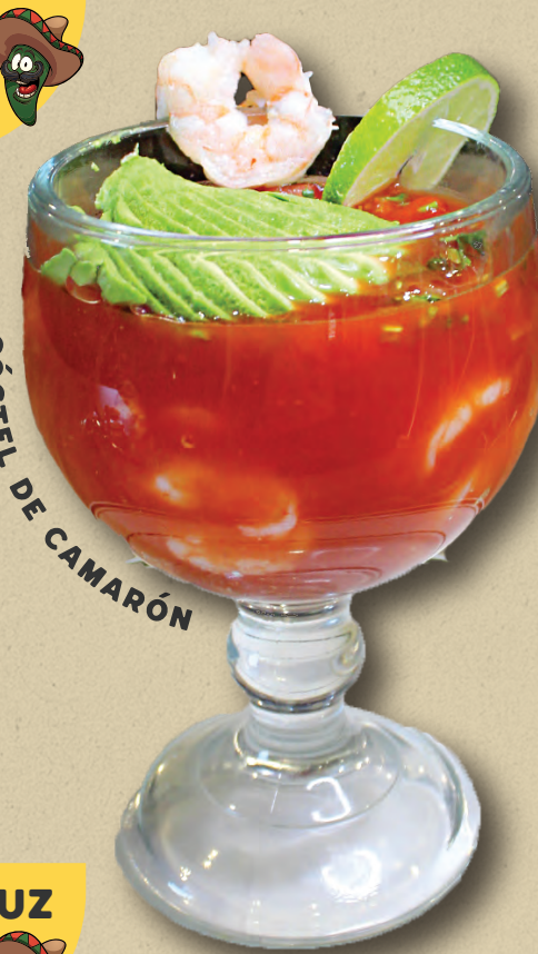
CÓCTEL DE CAMARÓN

Two poblanos stuffed with shrimp zucchini, and onions, cooked in our special cheese sauce and served with rice 16