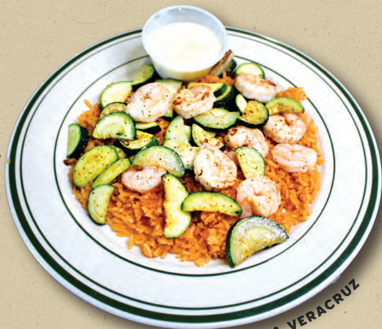
CAMARONES A LA VERACRUZ