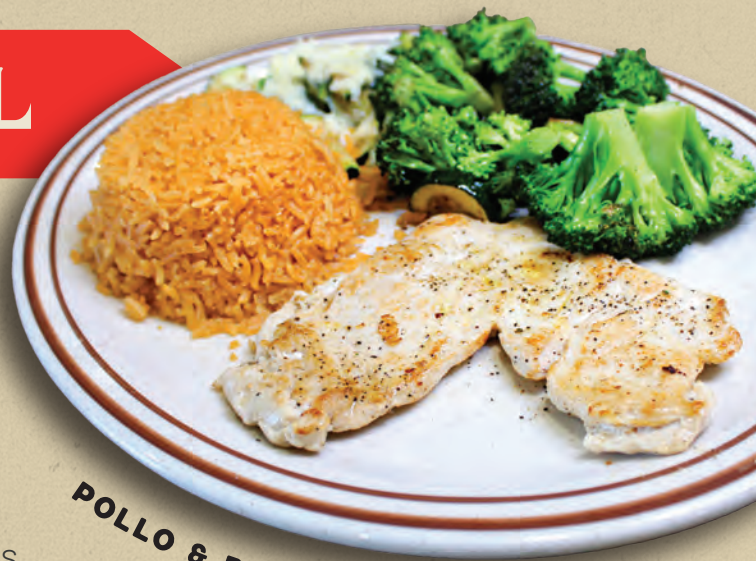
POLLO & BROCCOLI

1/2 pound freshly-ground Angus steak, cooked to order with melted cheese, smoked bacon, lettuce, tomato, and onion on a brioche roll. Served with fries 12.50