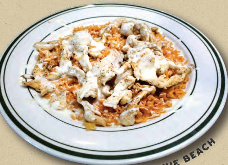
CHICKEN ON THE BEACH